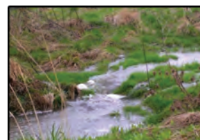
Pure water flowing from artesian springs on our farm

We use traditional farming methods and never spray our fields. As a matter of fact, in the 40 years our land has been farmed, it has never been sprayed with poisons or chemicals. In the process of becoming a Certified Naturally Grown farm, we have made a commitment to organic farming and land sustainability. And you will see and taste the difference in your fresh picked produce!