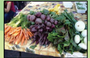
Our goal is to provide healthy, delicious, naturally grown produce

Fresh organic heirloom flowers market price