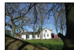
Our house and farm between beautiful oak trees that surround the property